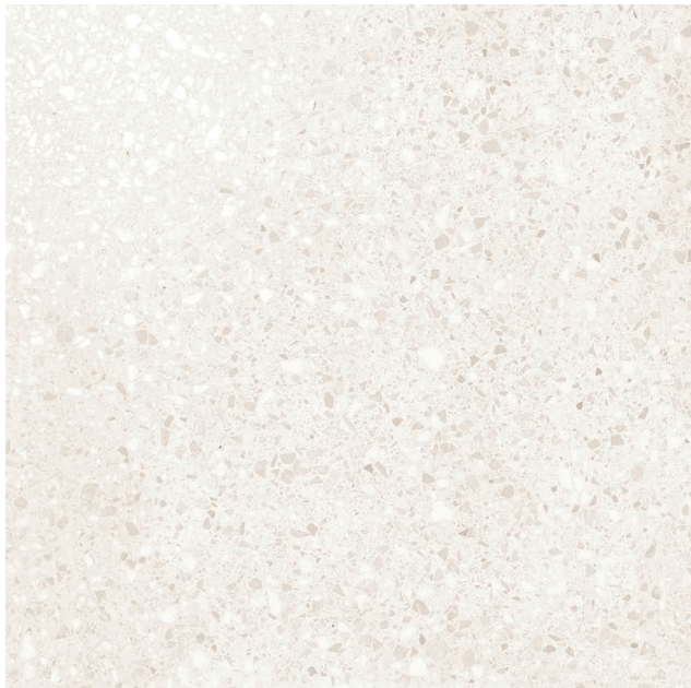
WHITE - Matte Finish