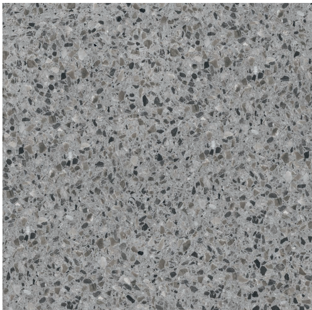
GREY - Matte Finish