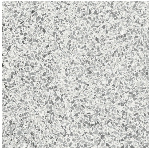
PEARL - Matte Finish